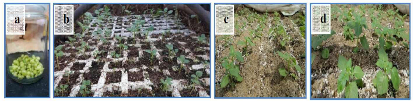
Fig. 2: Transplants establishment and growth in greenhouse; a. microtubers, b. transplants emergence after 4 weeks, c. and d. establishment of transplants in sand beds after 6 weeks.

Murashige and Skoog (1962) macro and micronutrients, Hoagland solution (Hoagland and Arnon, 1950) and commercial compound fertilizer N:P: K (20:20:20) at 1 g L<sup>-1</sup>. The treatments were arranged in complete randomized blocks design with four replications (2 varieties x 3 nutrient solutions x 4 replicates x 50 plants). Plants were irrigated weekly with the nutrient solution, the nutrient solution withheld within one month before harvest and plants irrigated with water only. Data of number of leaves and plant height were recorded after 10, 35 and 50 days from transplanting, the following measurements were determined after 65 days from planting; number of minitubers, fresh and dry weights of minitubers, stems, leaves, and roots. number of minitubers/plant, minitubers weight/plant, and average minituber weight were determined upon harvest. Data were analyzed using Statistix 10 software. Data were analyzed for statistically significant differences using LSD test at 5% level.